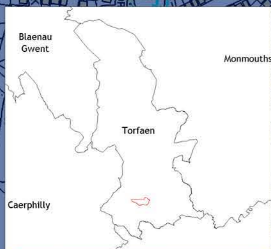
Map derived from O.S. 10k Landplan